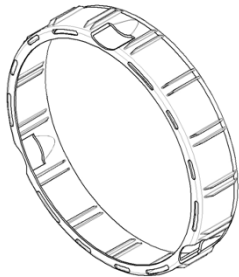
Figure 3: ZW700B-9060 Spacer Ring