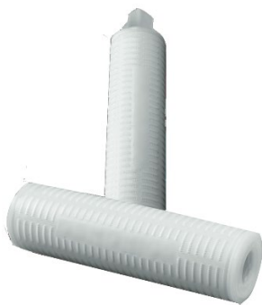
Figure 1: Flotrex PN Filters